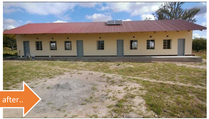
Before and after..